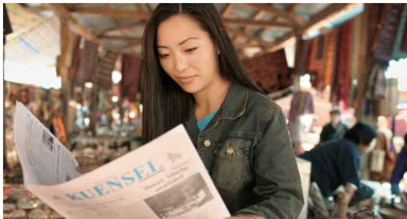
Young woman reading the paper in a market in Thimphu

The goals for the 10 th FYP are based on the 2005 census, which was the first census conducted in Bhutan. This has enabled Bhutan to establish a more accurate baseline for measuring development and has thus resulted in a number of adjustments of the previous and quite insufficient baseline figures used for the 9 th FYP.