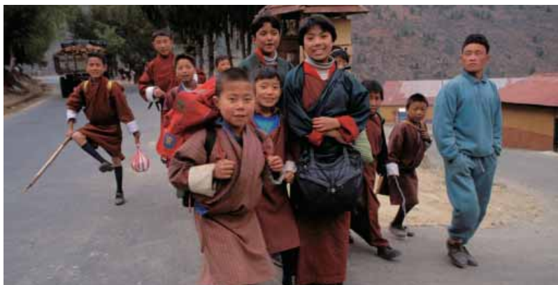
Children on their way to school in Thimphu

The overall objective for the development cooperation between Bhutan and Denmark during the strategy period is poverty reduction through the promotion of sustainable economic development, strengthening of the private sector development, democratisation and good governance, gender equality and respect for human rights.