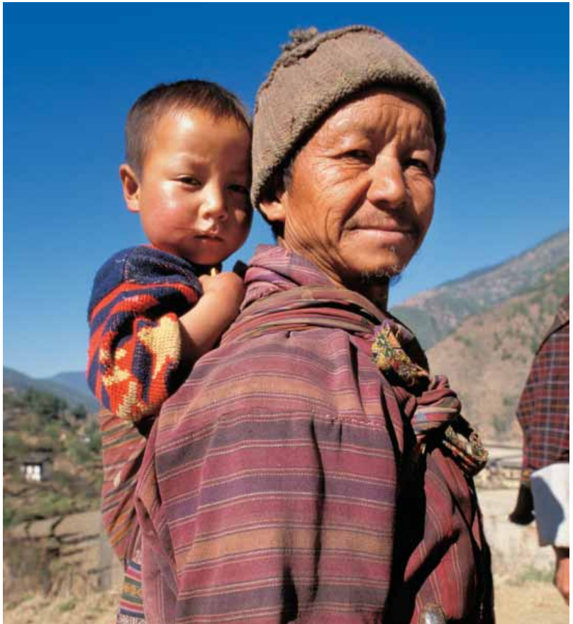
Father carrying his son in the Chukkha province

An evaluation of the country programme, assessing the results achieved since Bhutan became a Danish programme country, has been initiated and will provide direction for the future development cooperation between Denmark and Bhutan. The evaluation is expected to be carried out in three stages, the first of which was carried out in 2006, and the second one to be carried out in 2009, with the purpose of creating a framework for a sustainable phasing out strategy.